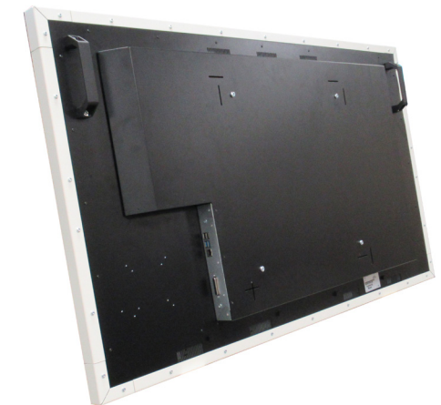
Backside of Brilan 4K 54.6, including glass protection frame in white

All figures are typical values. The real values of the panel may vary. The optical characteristics are determined after the panel has been „ON“ for approximately 30 minutes at an ambient temperature of 25° C (77° F).