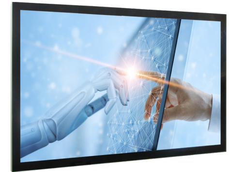
Monitor with bezel